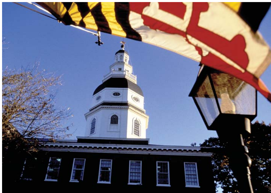
The Maryland State House is the oldest state capitol still in continuous legislative use and is the only state house ever to have served as the nation's capitol.

Please also be aware that some retirement agency forms require a member to sign or have the form notarized, as indicated in the form's printed instructions. Forms submitted without the necessary signature or notarization are not valid and will be returned for completion.